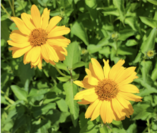
Katherine N. Stahlhut et al. 2024. Measuring leaf and root functional traits uncovers multidimensionality of plant responses to arbuscular mycorrhizal fungi. American Journal of Botany https://doi.org/10.1002/ajb2.16369

Mycorrhizal fungi are important for the growth of many plant species, but the impact of this mutualism varies across the plant kingdom. Scientists typically assess this responsiveness by measuring the change in aboveground biomass, but this only captures a fraction of the potential benefits mycorrhizal fungi can provide that improve plant fitness. Stahlhut et al. used 26 plant species from the Midwestern prairie ecosystem with and without mycorrhizal fungi to fully capture variation in whole-plant trait responses. While change in aboveground biomass did account for a large proportion of this variation, the changes in traits associated with root structure were also important, and their results suggest changes in root system foraging strategies were not always associated with aboveground biomass growth. The authors also found that aboveground growth responses were variable over time, with some responding with faster growth, while others had longer, sustained growth. The results of this study highlight that mycorrhizal symbioses provide more than just growth benefits but are also a key component of plant growth strategies involving multiple adaptive responses.