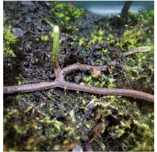
Jacob S. Suissa et al. 2022. A bump in the node: The hydraulic implications of rhizomatous growth. American Journal of Botany https://doi.org/10.1002/ajb2.16105

The archetypal plant is one that produces leaves and stems above ground and roots below ground. However, not all plants conform to this growth type. Many are rhizomatous, meaning they creep along the forest floor, producing both leaves and roots along their stems. These two ways of growing represent the starkest dichotomy in growth forms across plants. While data abound on the hydraulics of upright plants, very little is known about how rhizomatous plants move water through their bodies. Suissa et al. reconstruct three-dimensional vascular anatomy and explore whole-plant physiology to understand the hydraulics and functional implications of rhizomatous growth. They observe that water does not move freely across the rhizome but rather is impeded by areas of high resistance at nodes (areas where leaves develop). This observation suggests that nodes are chokepoints in axial water movement along the rhizome. These nodal chokepoints decrease the hydraulic interconnectedness of a rhizome but may protect the whole individual from the spread of damage or disease—suggesting a potential tradeoff in the principal construction of the fern rhizome.