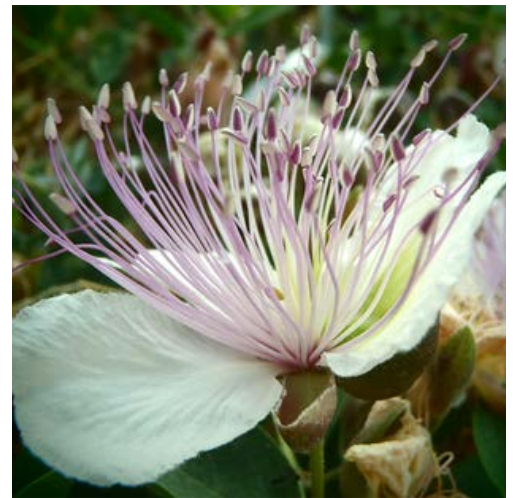
Aphrodite Kantsa et al. 2023. Intrafloral patterns of color and scent in Capparis spinosa L. and the ghosts of its selection past. American Journal of Botany . https://doi.org/10.1002/ajb2.16098

One of the many mysteries surrounding the flowers of Capparis spinosa (caper bush) is that although they are nocturnal, they are mainly visited by large diurnal bees, while nocturnal hawkmoths are scarce. To better understand the pollination biology of caper bush, Kantsa et al. investigated the potential pollinators' perception of caper bush flower scent and color. The authors analyzed the visual and olfactory cues emitted by the different floral parts in relation to the known sensory biases of the nocturnal (hawkmoths) and diurnal (bees, butterflies) visitors. Although flower visitation by pollinating carpenter bees was 8-fold greater than visitation by hawkmoths, caper appears to have indeed tightly co-evolved with nocturnal hawkmoths. The authors suggest that the paradox of flowers that show a mixed pollination system (hawkmoths/ bees) but are strongly biased towards the inconsistent pollinator is sustained because of sufficient overlap in the timing of bee activity and flower opening, and to specific eco-physiological features that allow plants to sustain the production of amino-acid rich volatiles and large quantities of nectar that attract occasional but highly effective visits by hawkmoths.